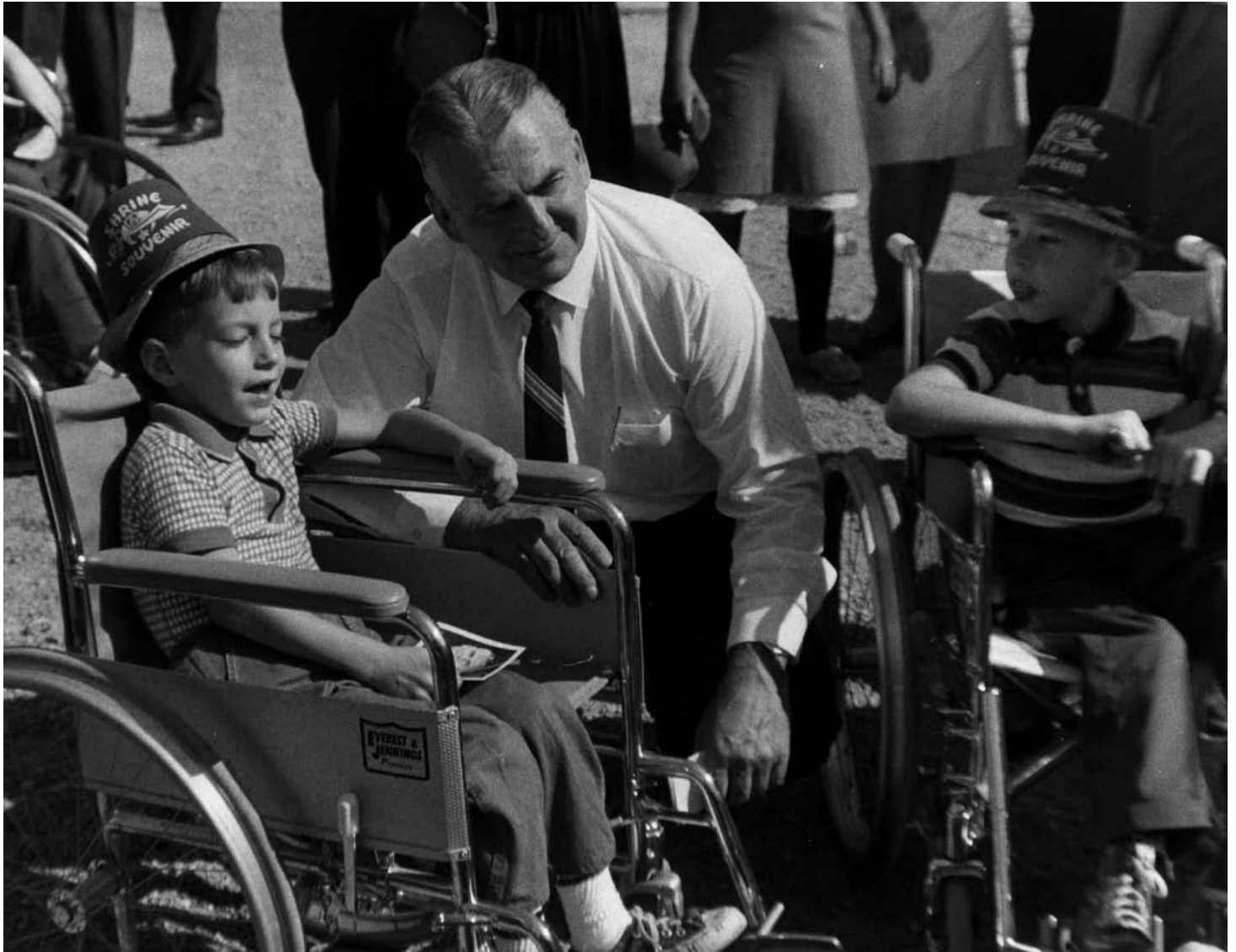
The primary skill required by a governor, according to Avery: "You have to like people." He considered himself "blessed with this genetic trend, that's enjoying being around people." The governor is pictured here with two young boys at a Shriner's event, one of whom holds a photo of the governor in his hand.