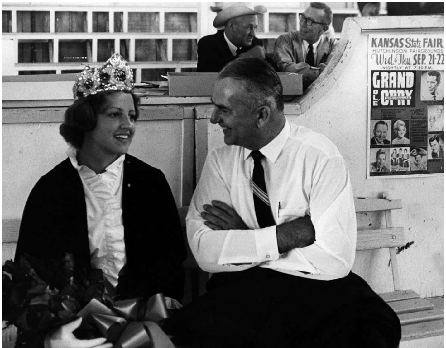
Avery genuinely enjoyed the ceremonial duties of the governorship that took him to countless county fairs, beauty pageants, ribbon-cuttings, and awards ceremonies. Very few governors in Kansas history enjoyed the job more than Bill Avery, pictured at the 1966 state fair in Hutchinson with the newly crowned Dairy Princess.

So, I got on a train and I didn't get off at Manhattan, I just rode on down to the next college town. That is a little of a misstatement because Washburn would have been between. Let me apologize. But at that time I don't think I ever heard